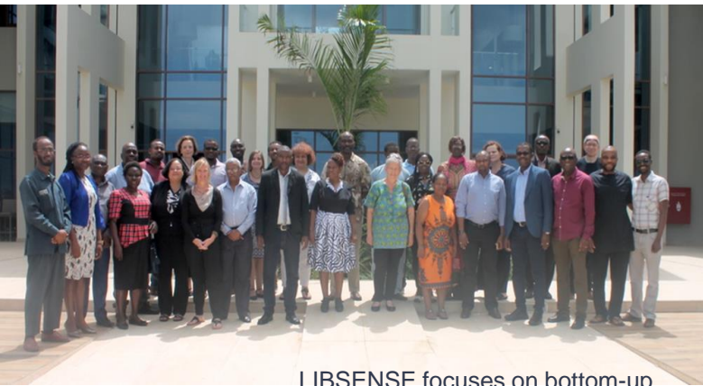
LIBSENSE focuses on bottom-up and grassroots programmes of action initiated by its community